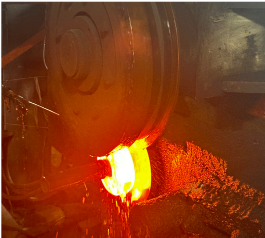
Advanced Ring Rolling