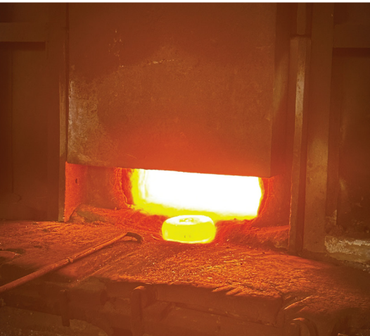
Temperature Controlled Oil Furnace

Zenith Group has been the pioneer in the manufacturing of Forged CTC Segments for the Tea Industry since 1971! With our state-of-the-art forging unit in Howrah, West Bengal, Zenith Group is the leading and most trusted supplier and exporter of CTC Segments to tea estates and factories in India and around the World! With strict quality control measures during manufacturing, it is our constant endeavour to ensure maximum customer satisfaction.