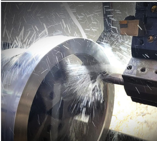
CNC Turning Machining