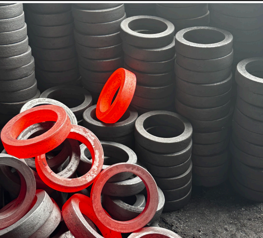
Pre Machined Segment Rings