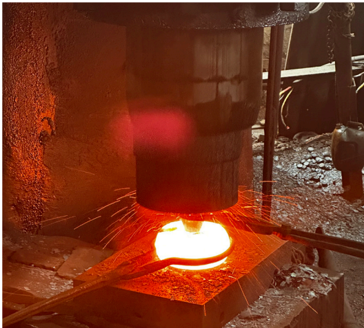
Pneumatic Hammer Forging